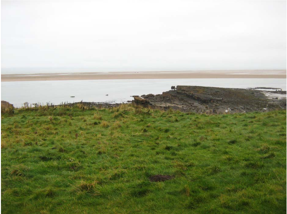
Areas 2: Area not survey by the GPR survey

Most of Area 2 has been covered by the GPR survey, although a narrow gap of approx 5m was not (see photograph below and Figure 1). Although it may be possible to cut the grass, the ground itself is undulating and 'bumpy', and slopes towards the cliff edge, possibly not making it suitable for GPR survey.