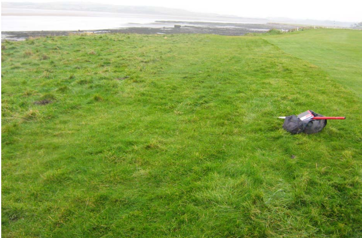
Area 1 (photo taken from the West and standing in line with the cave entrance)

Area 1 is a thin strip of grass between the edge of the fairway and Area 2, and is approximately 4m wide. The area looks to be 'casually maintained' by the golf course; that is, it is not as well manicured as the gold course itself but the grass has been cut recently.