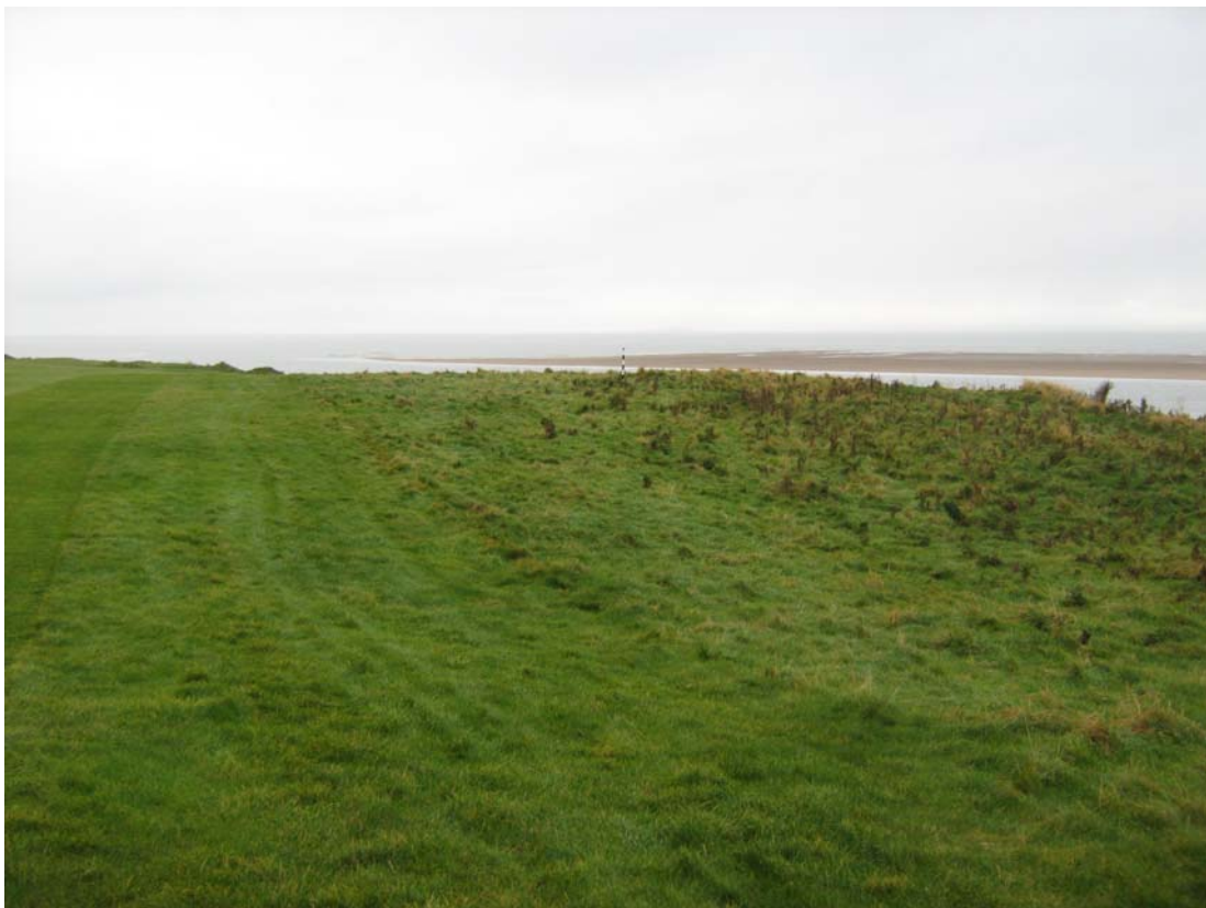
Areas 1 and 2: Looking West