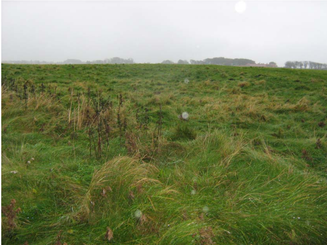
Area 2: Photo taken standing on top of the cave entrance, looking at the general location of the course of the smugglers cave (as depicted on 1940s sketch).