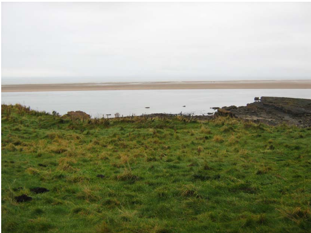
Area 2: Looking North towards the cave entrance