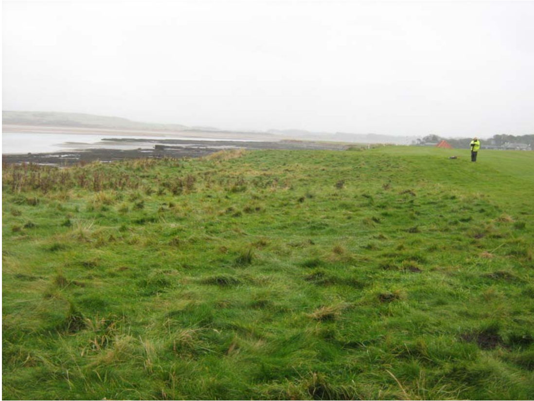
Area 2: Looking East